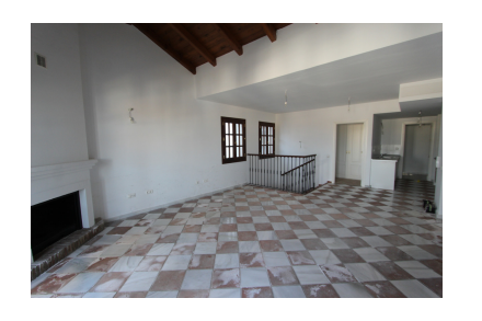
Price: 284,000 € Printing day : 9th September 2025

M<sup>2</sup>: 150 Parking places: by request