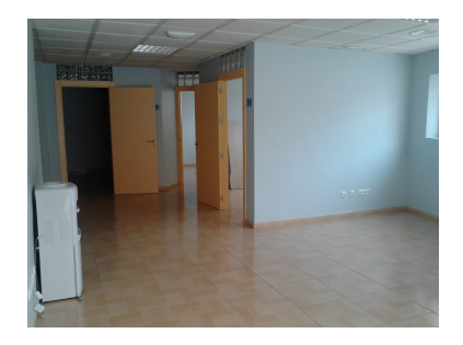
Price: 164,500 € Printing day : 10th September 2025

Bathrooms: 2M²: 133Property Type: CommercialParking places: by request